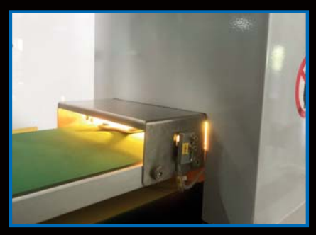
Secure built-in drying process