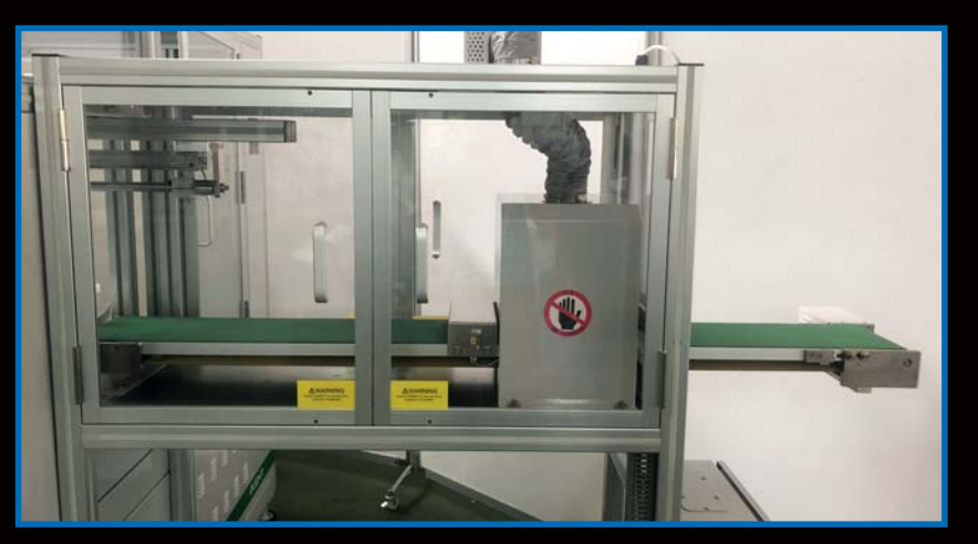
For high efficiency industrial use