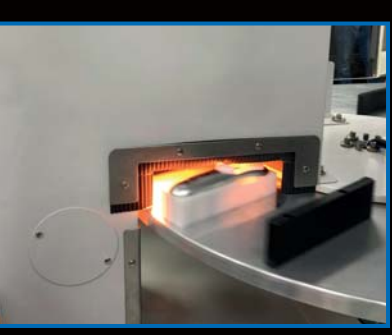
Designed exclusively for KENT automation