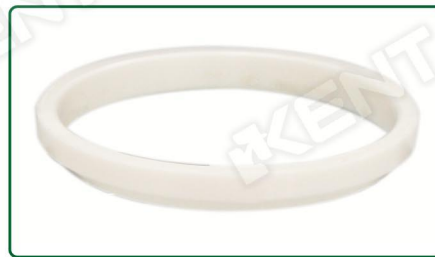
New ceramic material ring

With increasing environmental awareness, the use of open ink tray is no longer desirable. Sealed ink cup became the only sensible option, and the inexpensive yet effective sealed ink cup is the most suitable candidate for the job.